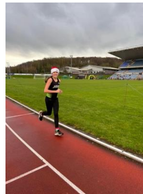
Bah Humbug & Xmas Party