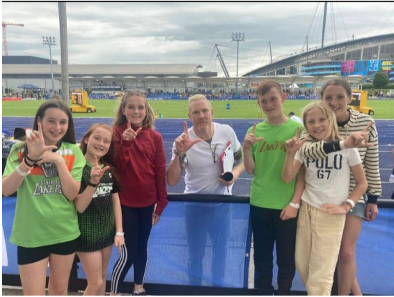
UK Athletics Champs