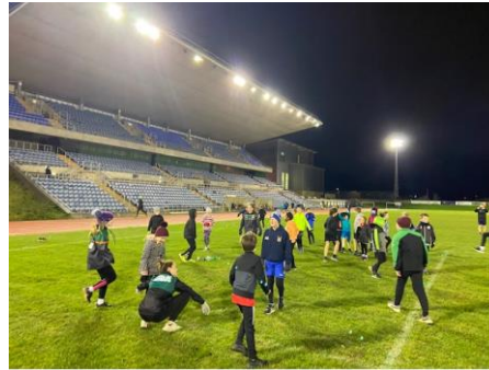
Nov 23 Celebrated 2yrs at JCC